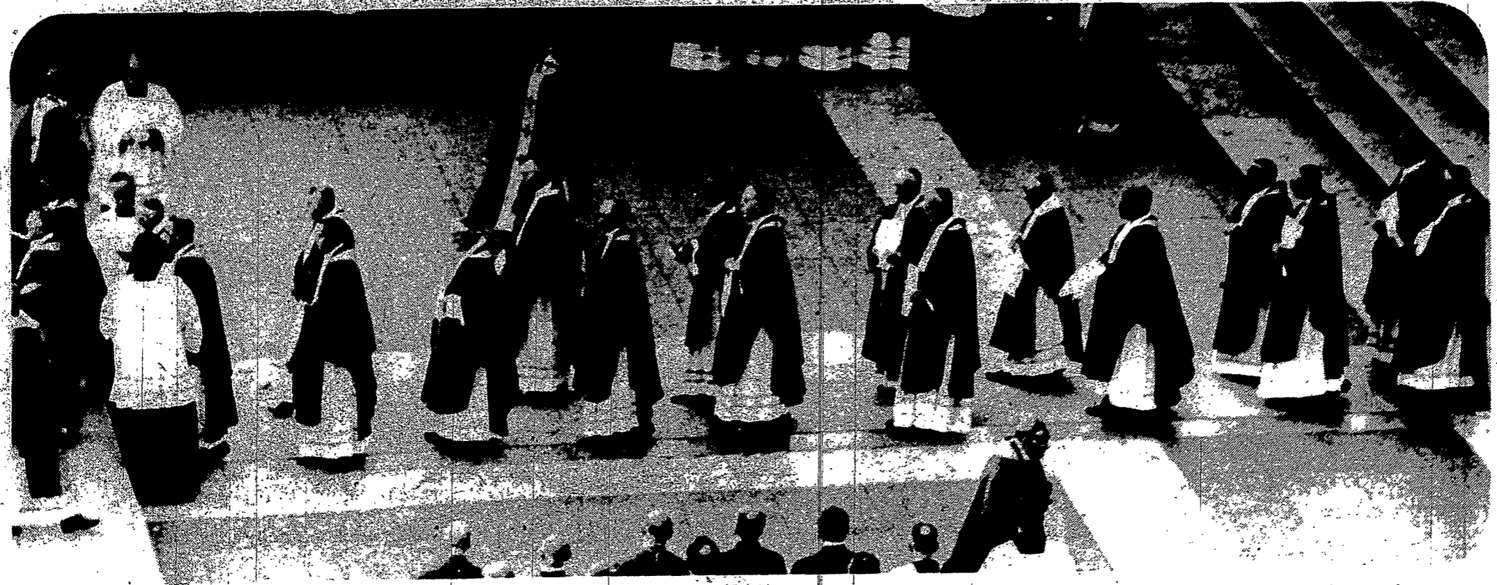
The offertory procession.