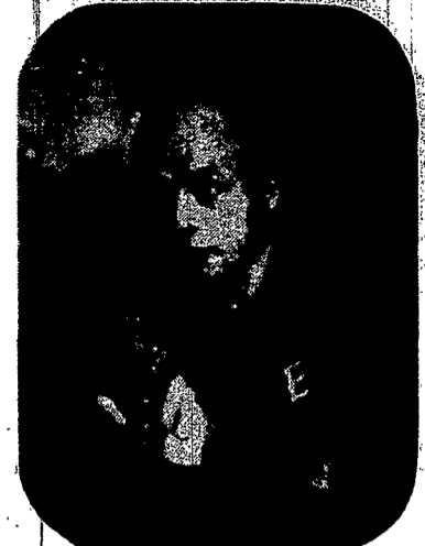
Aleksandr Ginzburg, left, holds his son before his arrest in 1977. Above, Anatoly Shcharansky was sentenced to 13 years at hard labor.

Shcharansky was sentenced to 13 years at hard labor for treason and espionage; Ginzburg to eight years for anti-Soviet agitation and propaganda, and Petkus to 15 years in prison, labor camp and internal exile on similar charges.