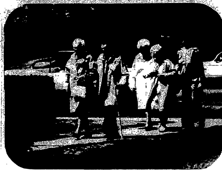
Guests begin arriving at St. Louis (left), and are welcomed by guild members above.