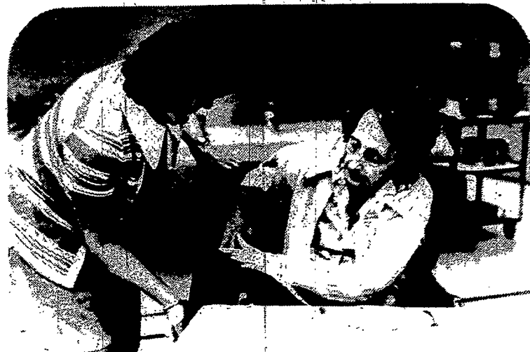
Volunteer assists with an overcoat.