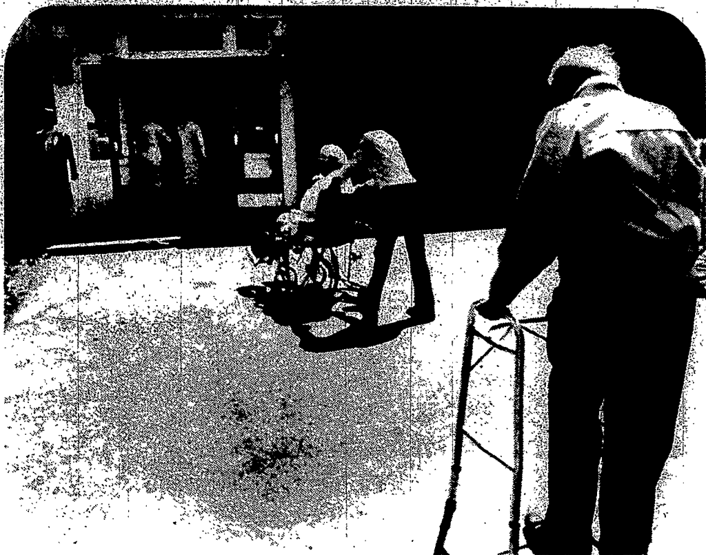
Residents of Monroe Community Hospital leaving their bus.