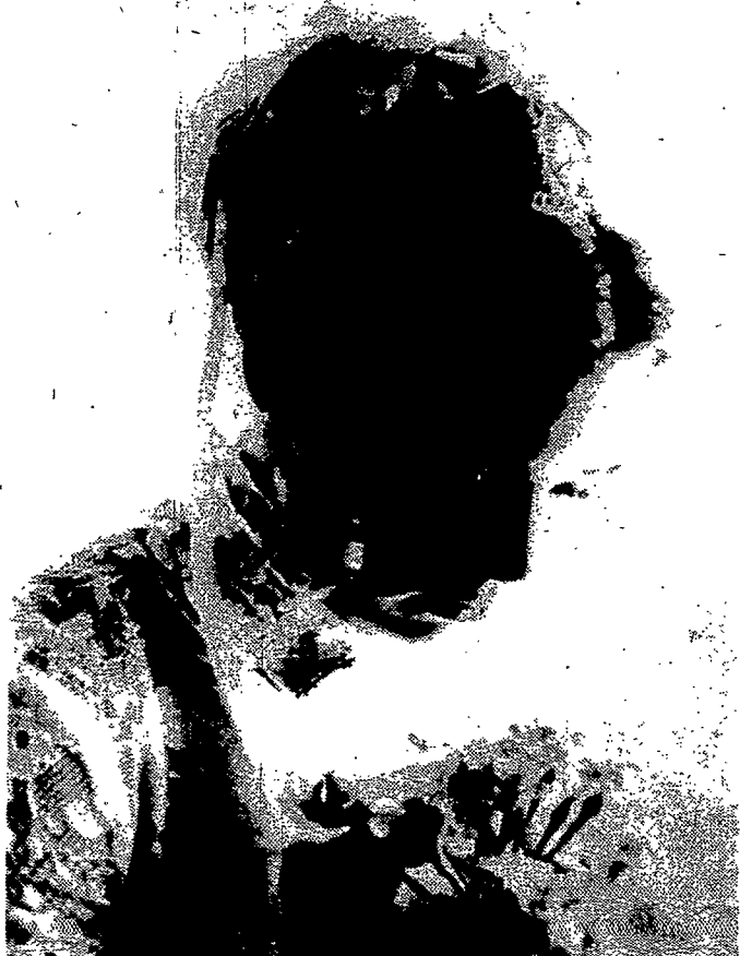
A portrait from Religious News Service.

licenses also may be applied for and obtained at any Town Hall.