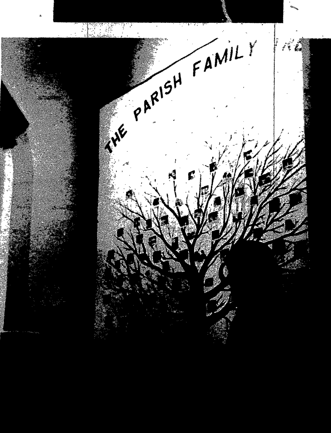
At Immaculate Conception, Ithaca