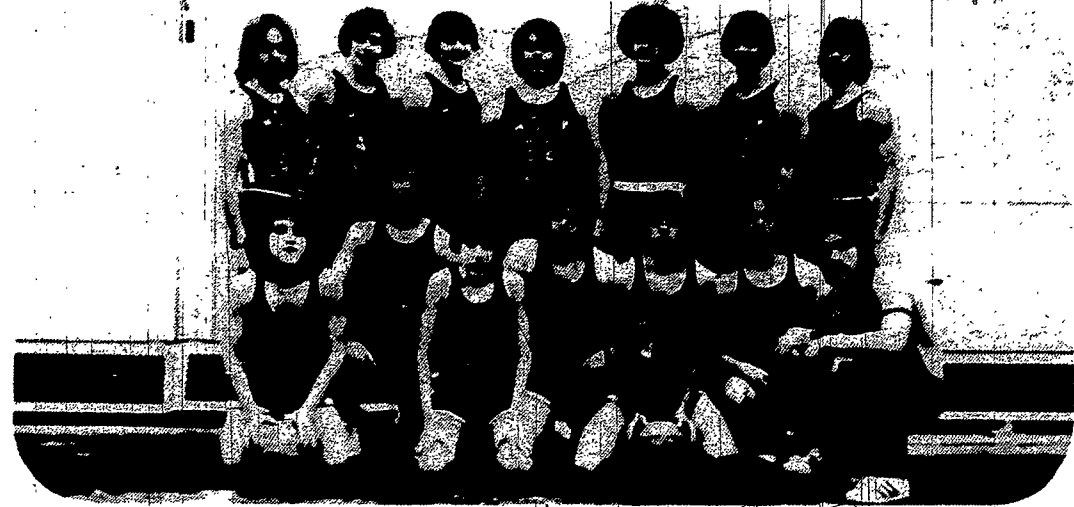
Holy Cross Varsity