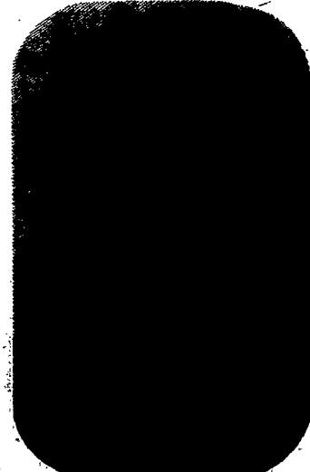
BISHOP O'MEARA world will be on exhibit in the main seminary corridor throughout the day.

Displays of artifacts from mission areas around the