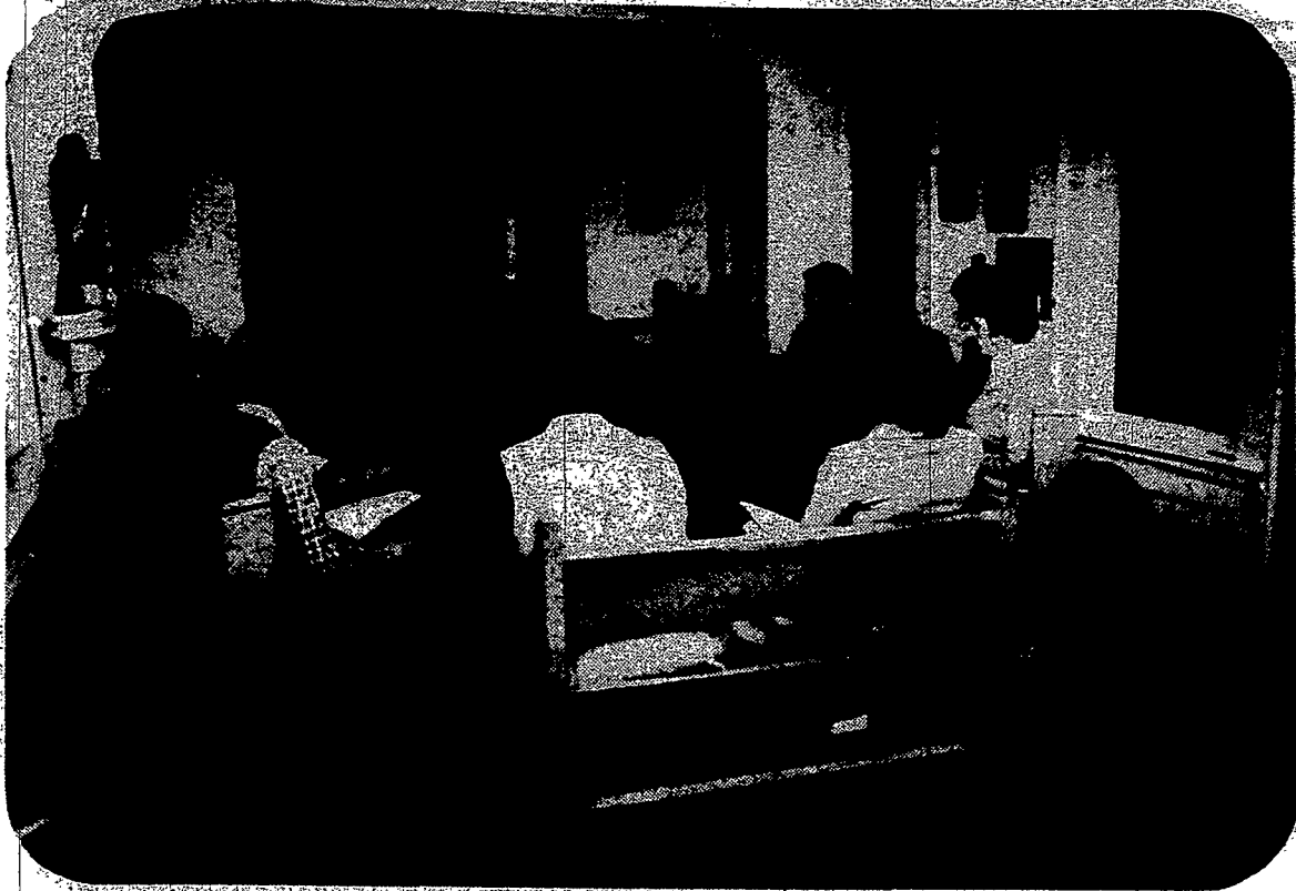
The chapel provides an atmosphere of intimacy with the Lord.