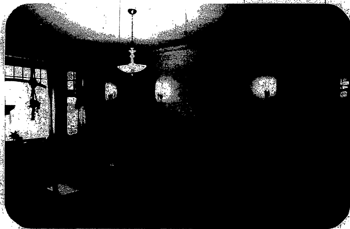
The dining room features a large window overlooking the gardens.