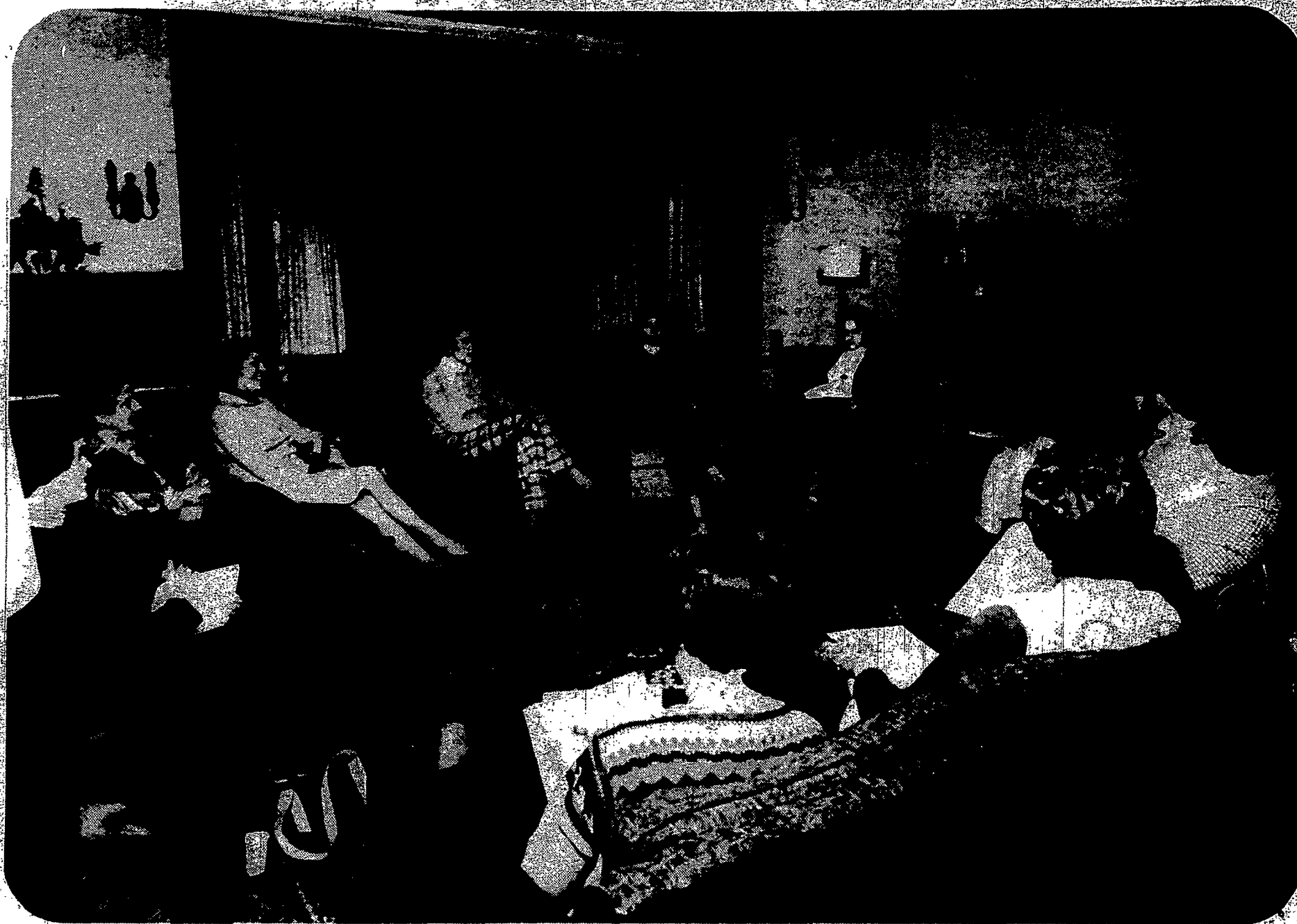
Spacious rooms allow for large-group meetings.