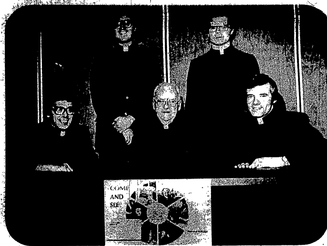
Contact Group