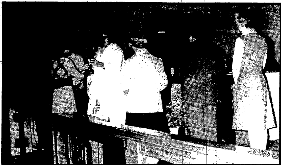
Sisters and guests from Penn Yan, Waterloo and Seneca Falls joined in the presentation of the offertory gifts.