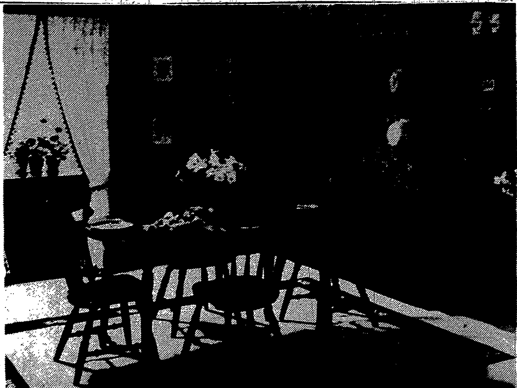
THE EIGHT-HUNDRED-DOLLAR-ROOM starts with sturdily traditional all-wood furniture from SK Products and finishes with everything else from the dime store to make a room that is low on budget and long on imagination.