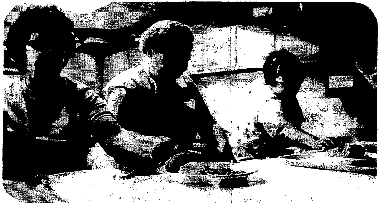
St. Charles Settlement house program for the elderly