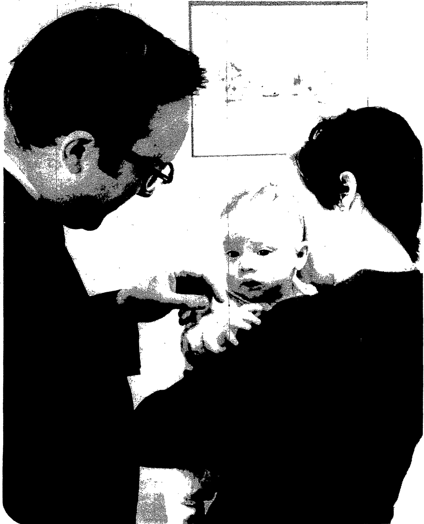
Office of Family Life