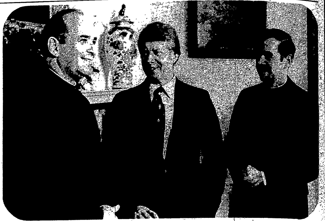
Carter Meets with Bishops

St. Charles Borromeo DEWEY AVE. PHARMACY Prescription Specialists COSMETICS — TOILETRIES PHOTO FINISHING 2910 Dewey Avenue 865-2210