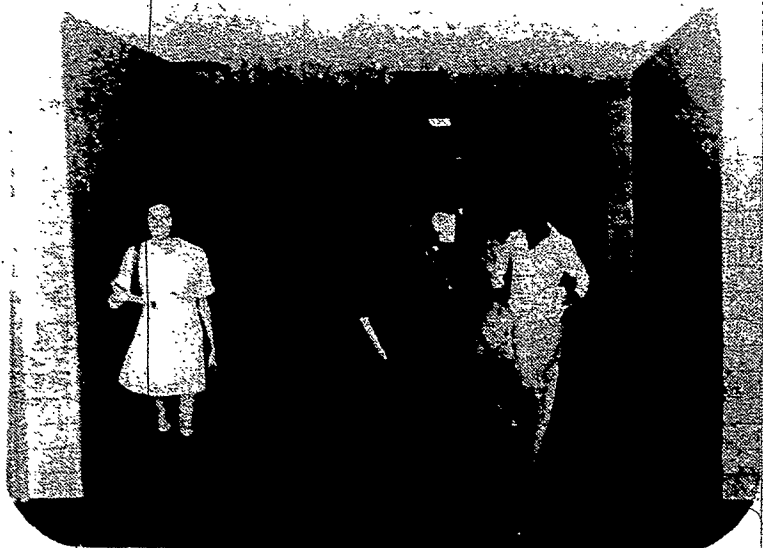
"Where, oh, where do we head now?" moaned St. Agnes freshmen.