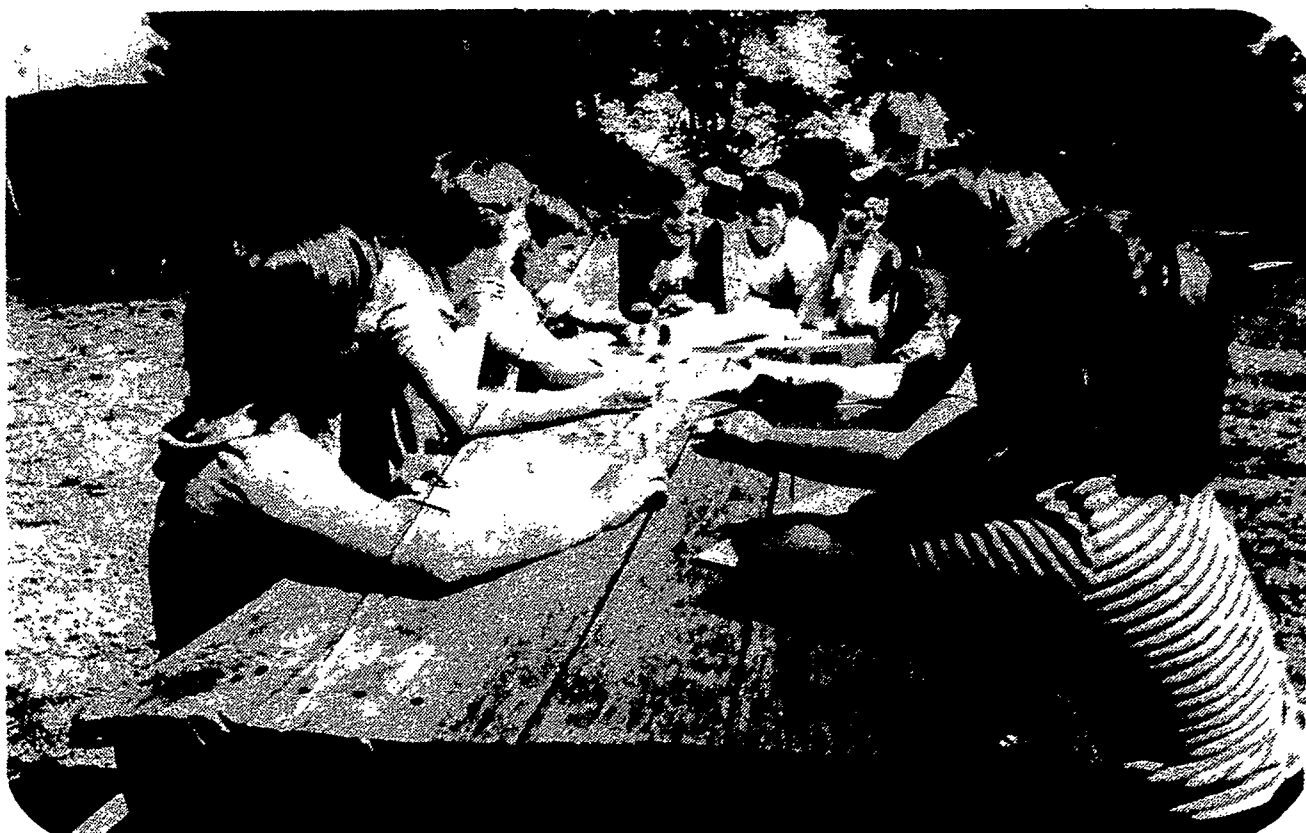
Youngsters enjoy their discussion during a morning workshop