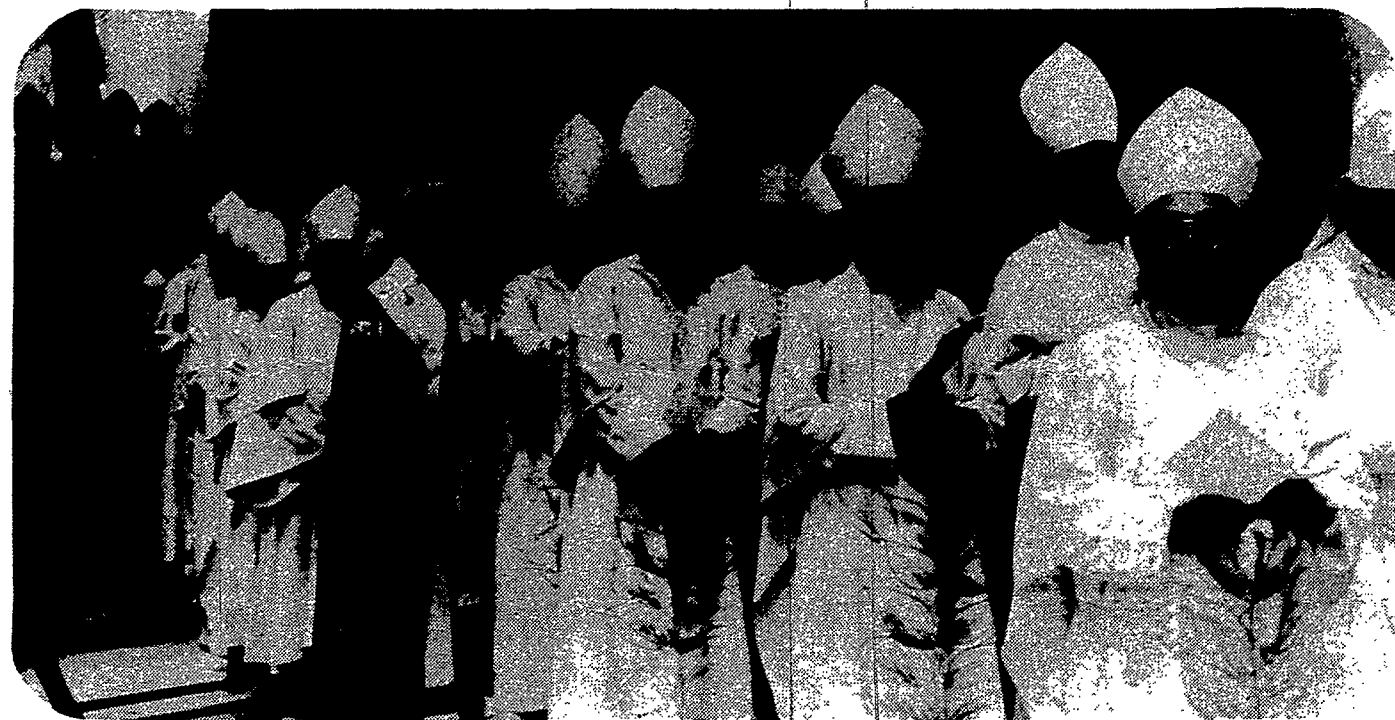
Bishops McCafferty and Hickey among other bishops.