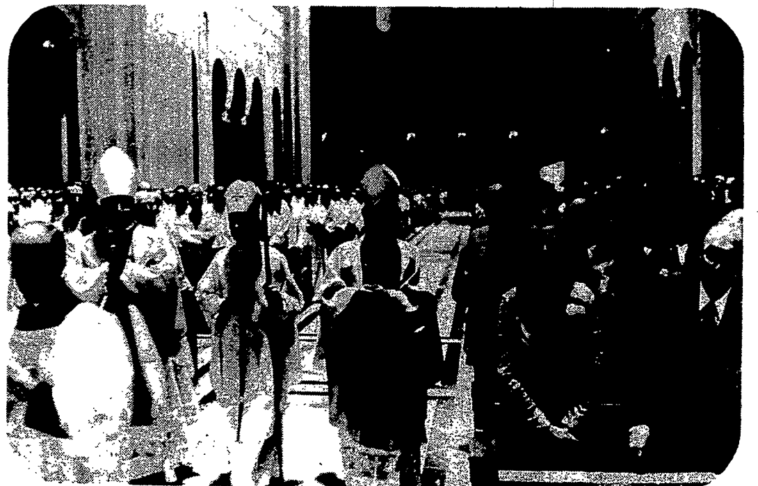
Bishop Kelly stands at the foot of the altar.