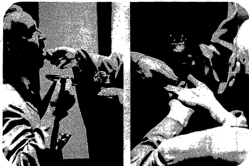
The Vatican has approved the reception of Communion both on the tongue and in the hand, for the United States.