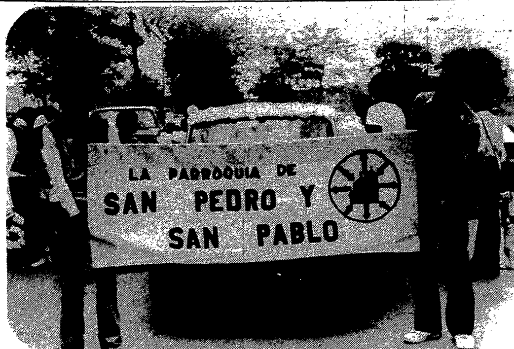
Spanish-speaking diocesans have been getting more active in Ss. Peter and Paul parish as in the San Bautista parade.

pleased that the office had managed to work closely with many at that grass-roots level to garner ideas to bring to the encuentro. At the same time he hopes to bring back some ideas from the encuentro to help in the work at home.