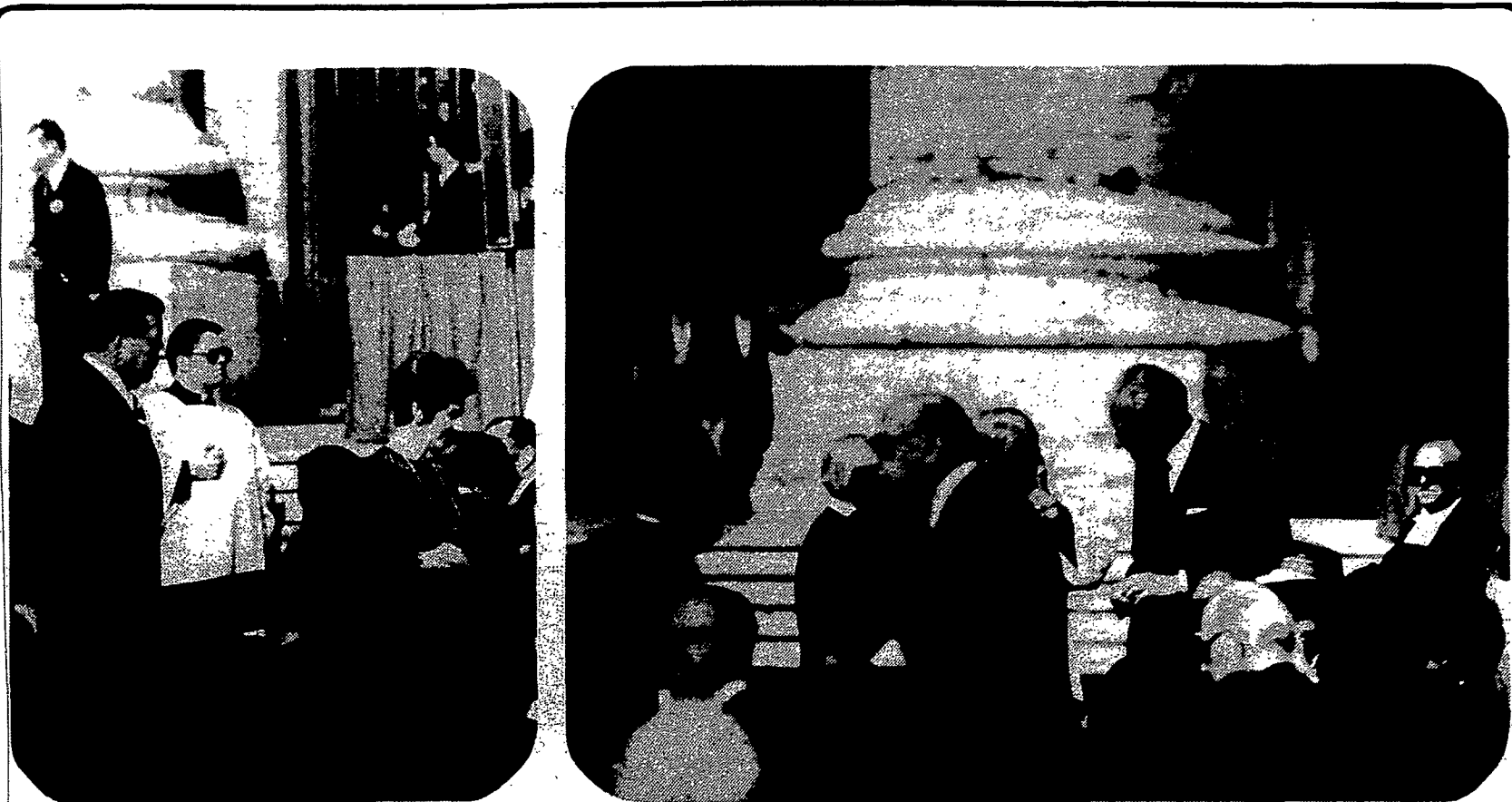
Mayor Frank Rizzo and his wife of Philadelphia, left, and Henry Cabot Lodge, U.S. representative at the Vatican, right, were at the rites.