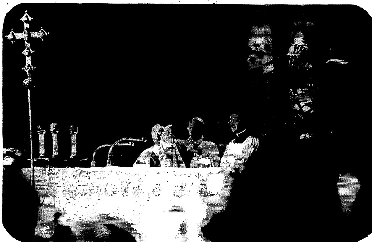
Pope Paul, during the canonization liturgy.