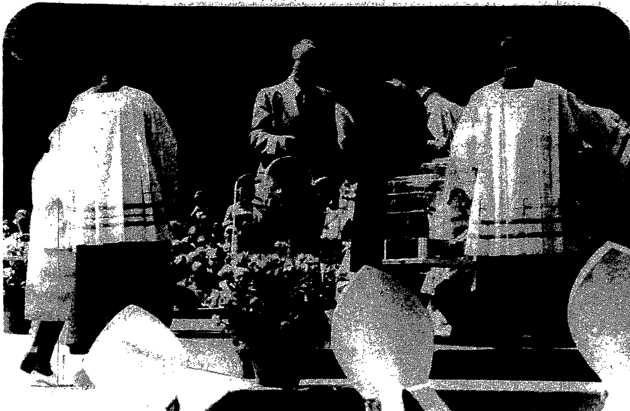
Gifts indigenous to areas served by St. John Neumann were brought to the altar.

Although overshadowed by the canonization, other events of religious significance were on the Rochester group's itinerary. These included visits to the other major basilicas of Rome; a special Mass at the Blessed Sacrament Chapel inside St. Peter's; a Mass in Assisi, home of St. Francis; visits to St. Anthony's hometown of Padua and St. Catherine's Siena; and a Mass inside St. Mark's in Venice.