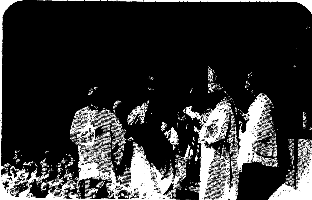
The Holy Father arrives for canonization ceremonies.