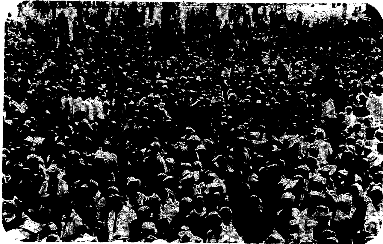
Part of the crowd of some 25,000 in St. Peter's Square.