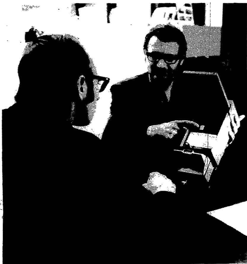
RG&E Wiring Specialist explains advantages of installing GFI to customer.

For more information about GFIs fill out and return the coupon on this page or call 546-2700, extension 2225 for a copy of our "Shock Stopper" booklet, or contact your local electrician.