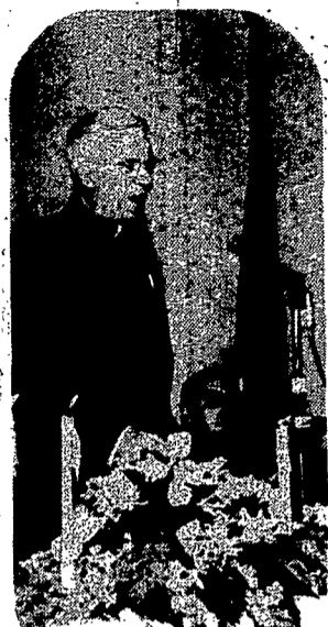
Before the Nocturnal Adoration Society, 1966.