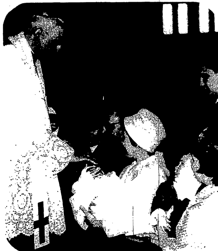
Blessing the babies.