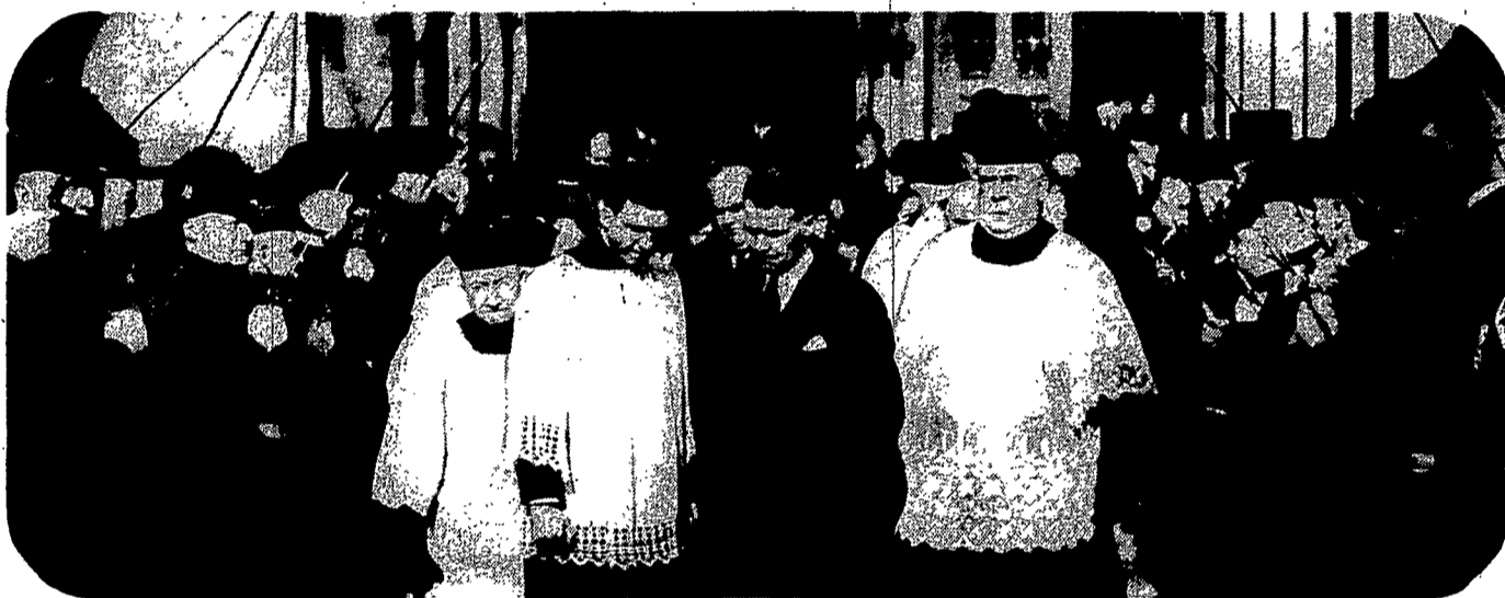
Archbishop Hickey funeral in 1940.