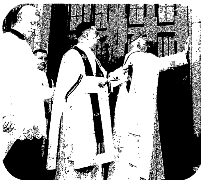
Consecrating the cathedral... 1961.