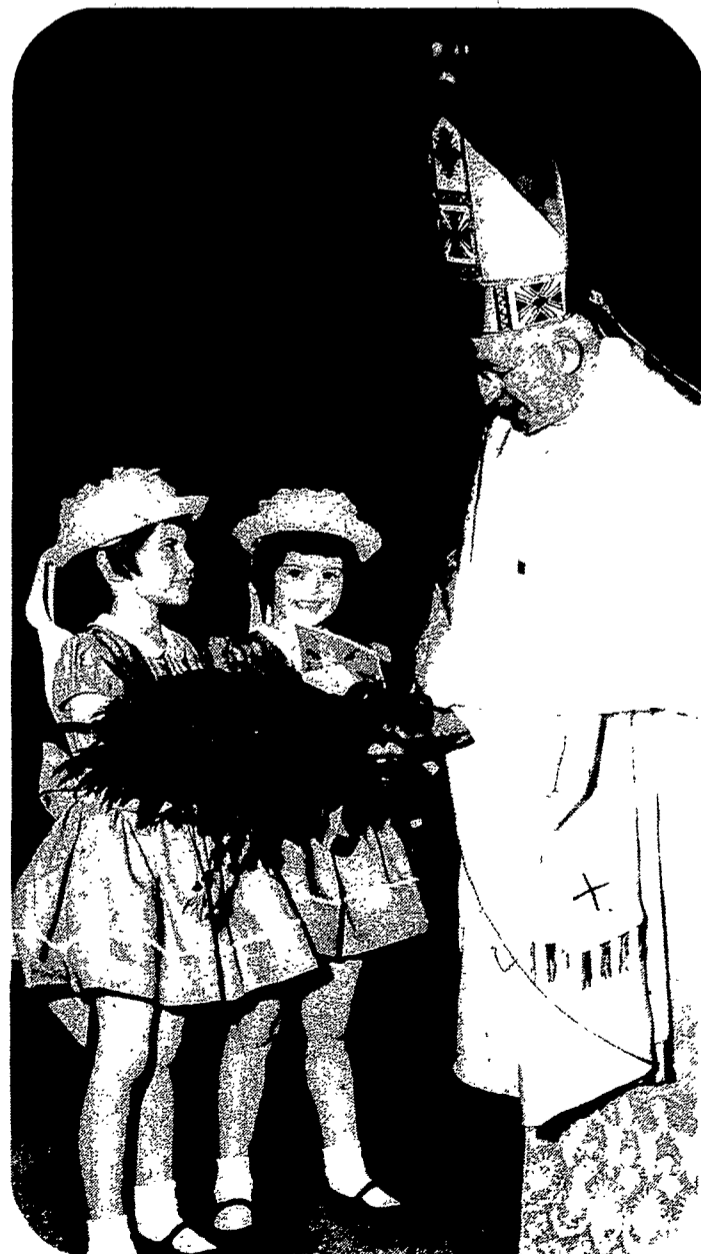
Auburn . . . a gift of roses.

long a ely we wrong o turn out of a His urance their r to be han to t. We he old