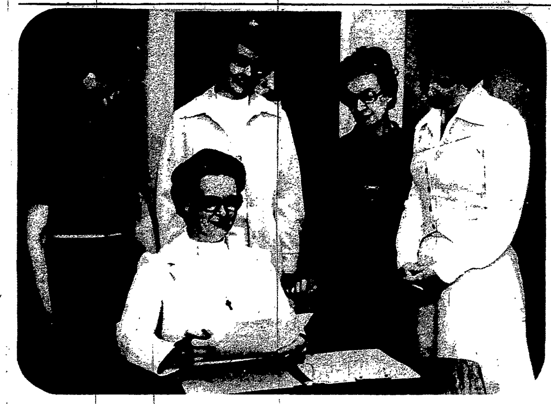
Mercy Council Installed

Nicene Apostle to our he Sai lhe alta Sacrifico