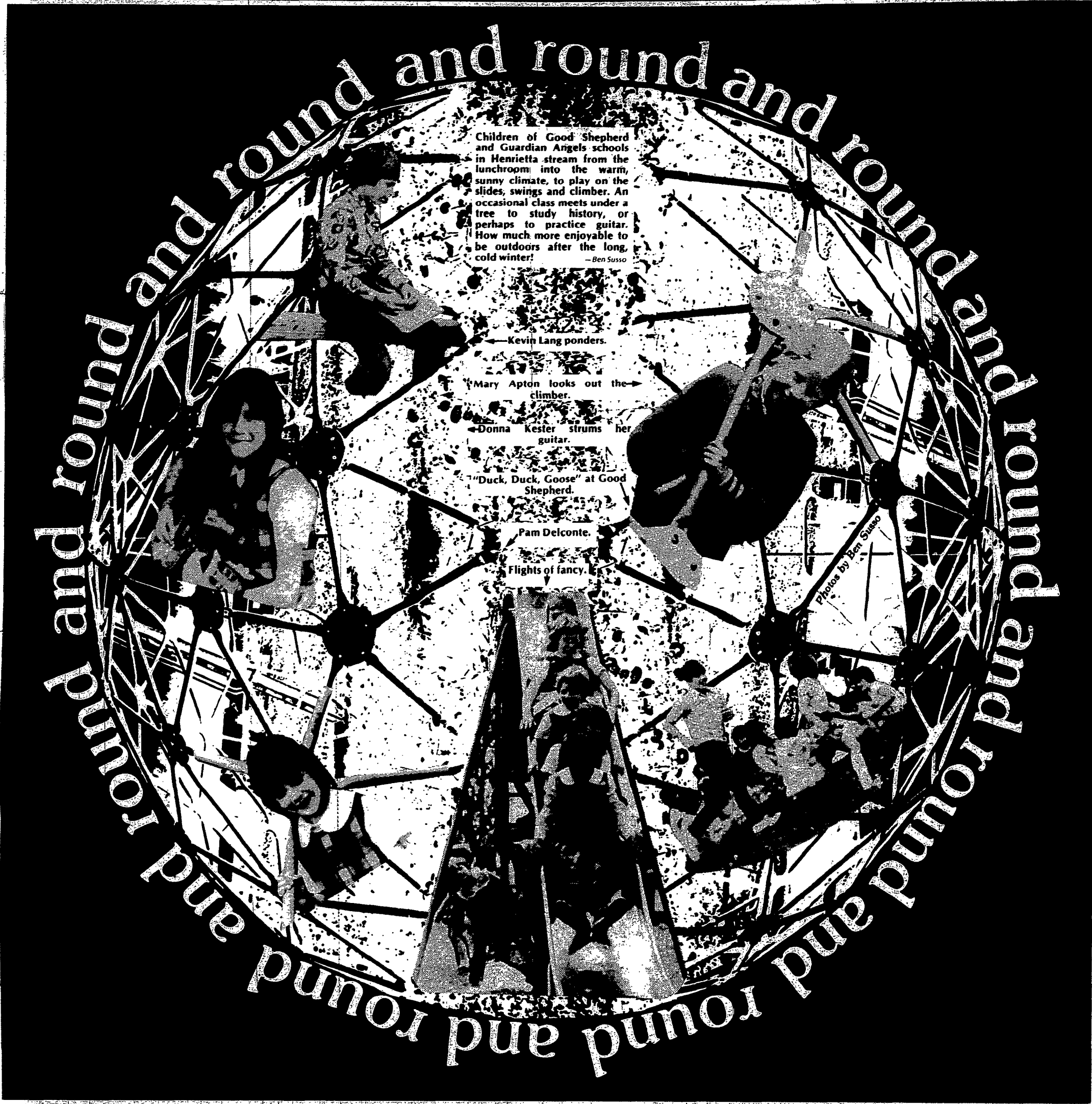
Children of Good Shepherd and Guardian Angels schools in Henrietta stream from the lunchroom into the warm, sunny climate, to play on the slides, swings and climber. An occasional class meets under a tree to study history, or perhaps to practice guitar. How much more enjoyable to be outdoors after the long, cold winter!