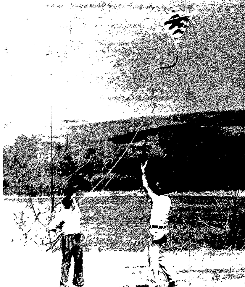
A beautiful Spring day provided an invitation for kite flying that couldn't be passed up.