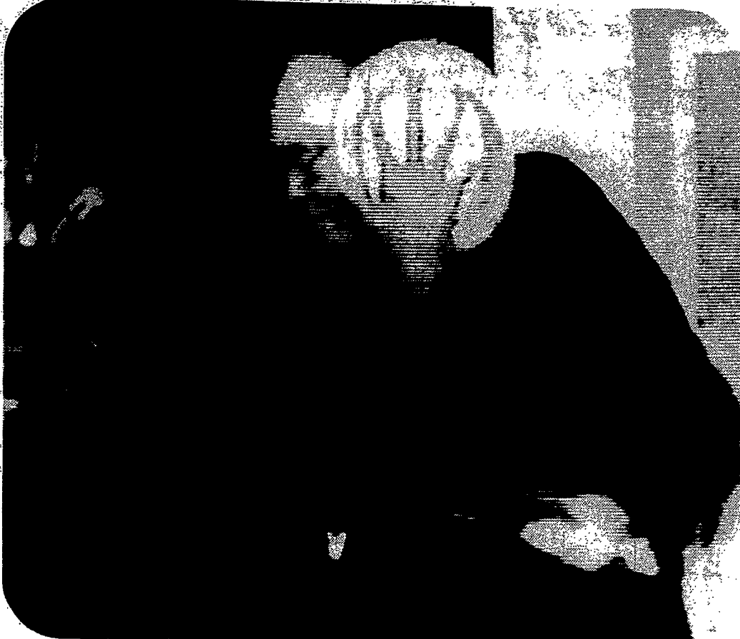
Archbishop John R. Roach is shown in television tape reproduction being hit by pie.