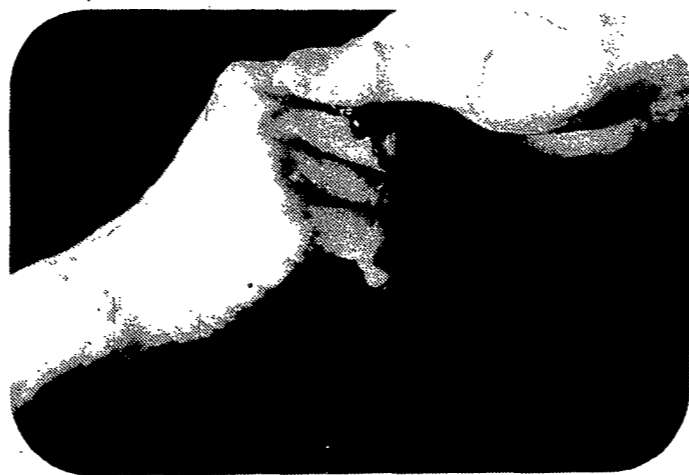
A touch conveys much love.