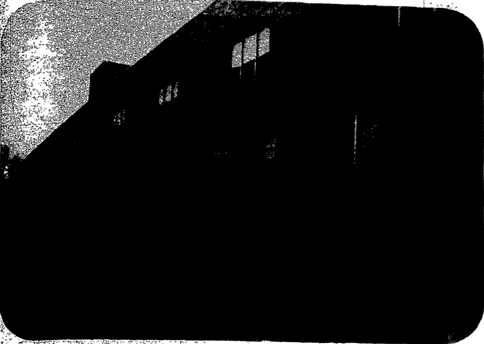
A view from the Mercy Motherhouse of the novitiate building that will house the new infirmary on the second floor.