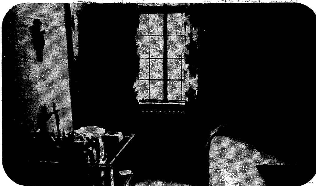
The present treatment room.