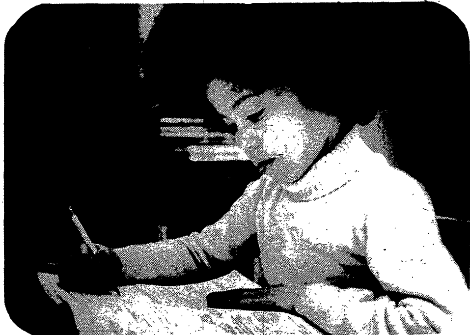
Making that final decision before recording the answer in her workbook.