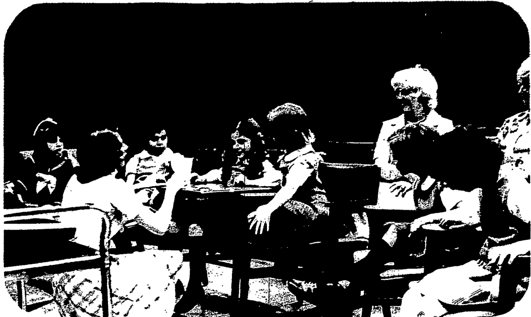
First graders from St. Casimir's School recently toured St. Joseph's Hospital in Elmira. Above, they learn about a spelling board used in children's speech pathology; below, left, a "pretend" broken arm is put in cast and, right, hearing is tested.