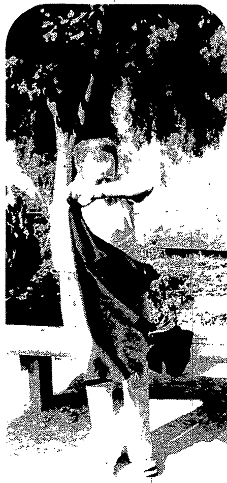
"How do you get these clericals on?"