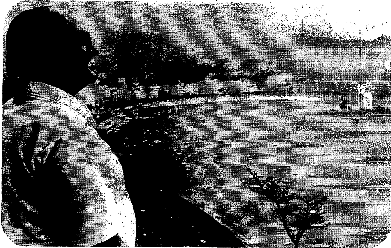
"If everyone in this whole area gave $1 to the missions..."