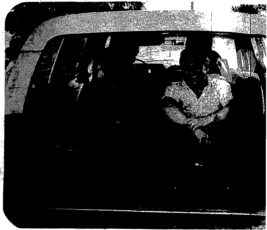
The boys on the bus.