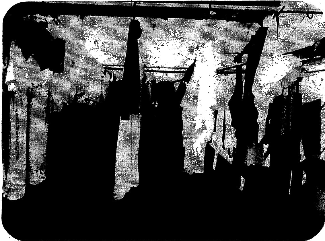
Somebody told him he ought to hang 'em up.

We have rounded up some of the more inspiring photos of these endeavors so that Courier readers, too, may join in on the less dire moments of the visitation tour.