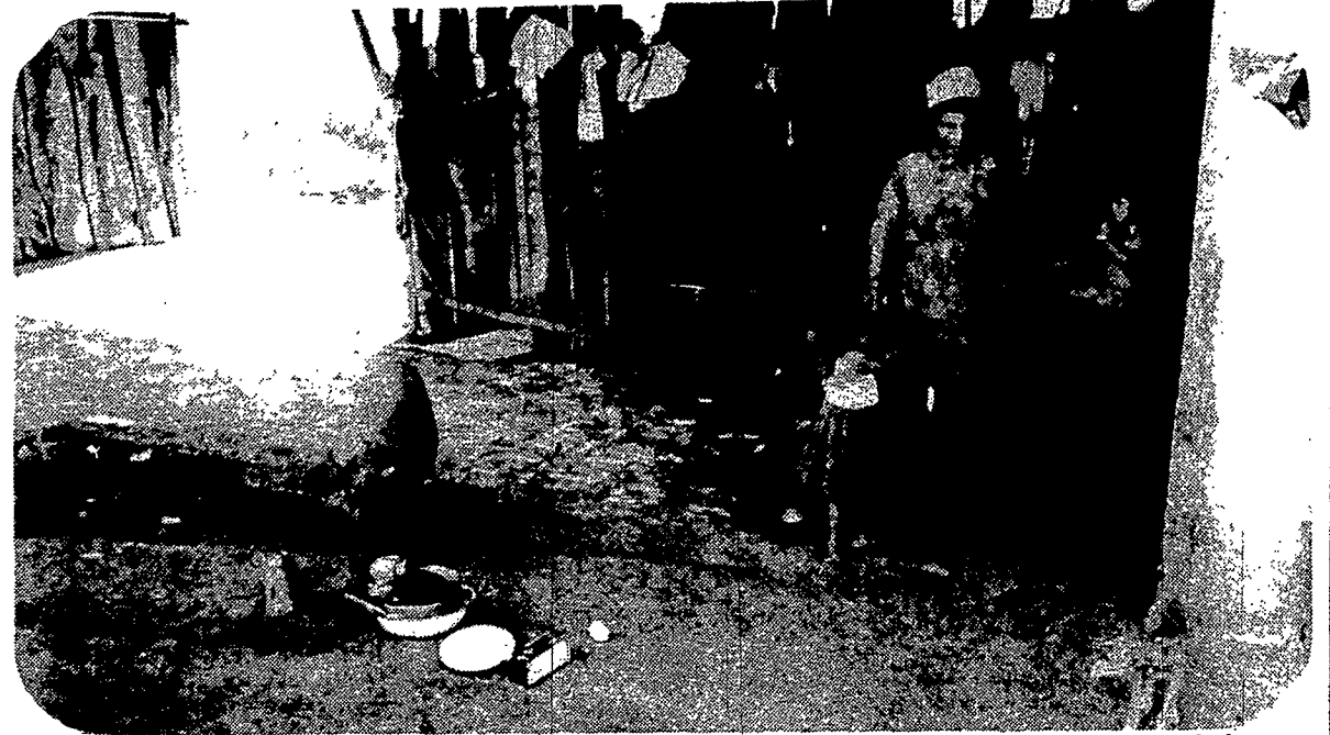
A pig eats out of a dish. Moments before it and a child ate together from the same dish.