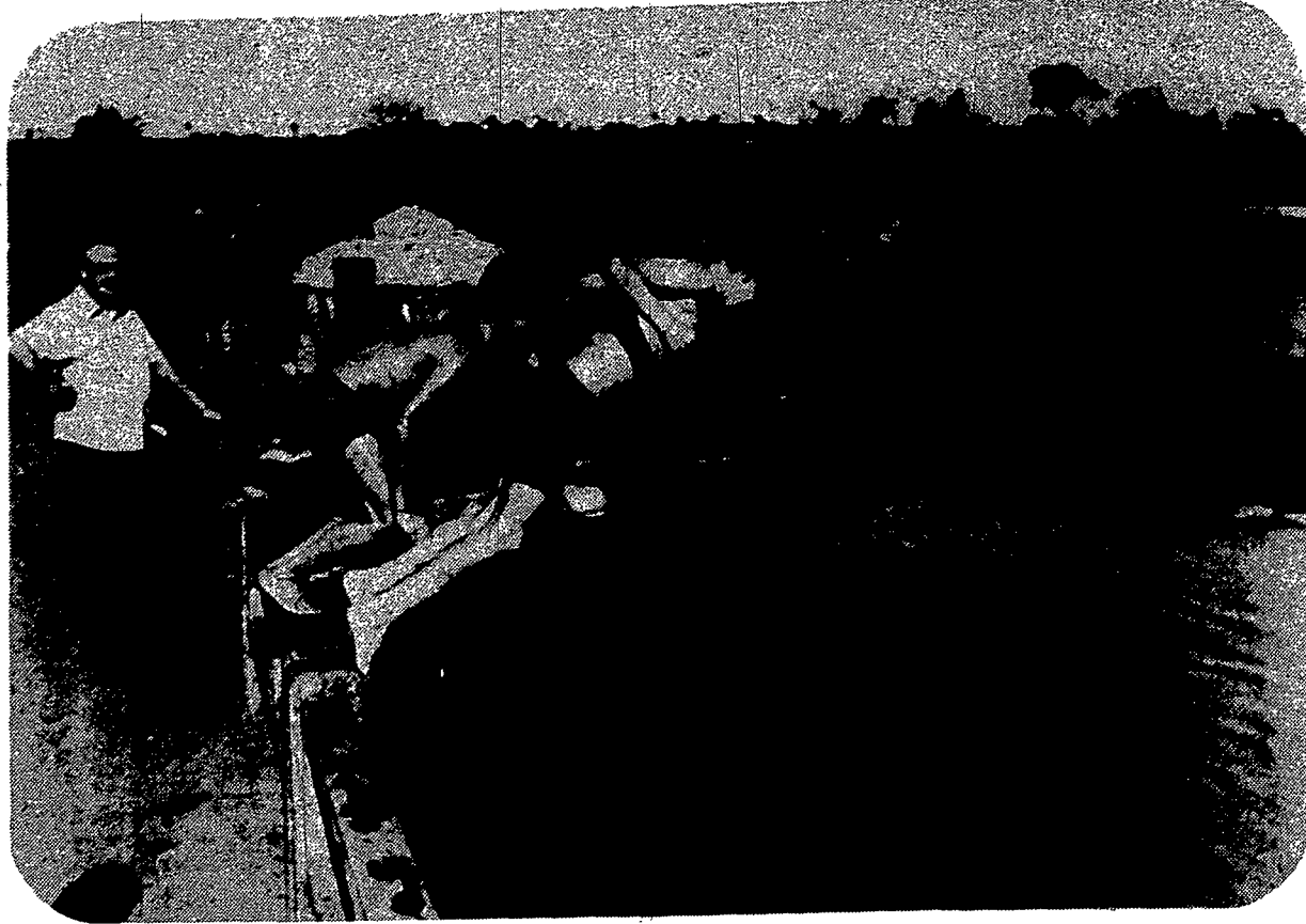
The locals treat Bishop Hogan to a diving demonstration at their swimming hole. They use a bridge for platform.