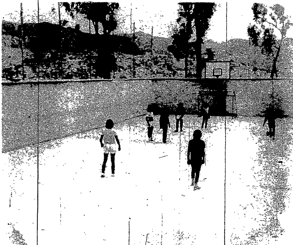
Soccer's the game in Bolivia.