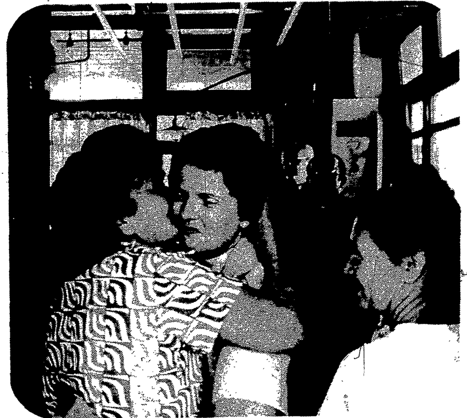
Latin greetings can be effusive.