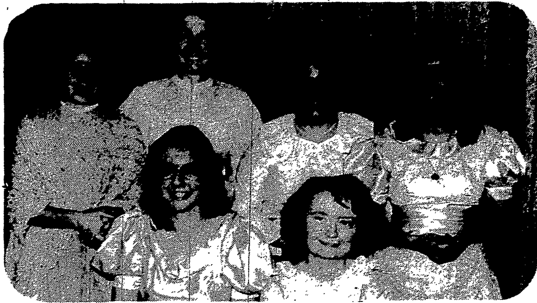
Gilded Age Dinner