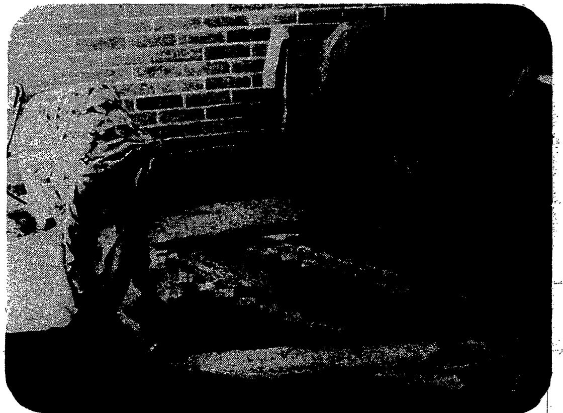
Another quilt on way to market.