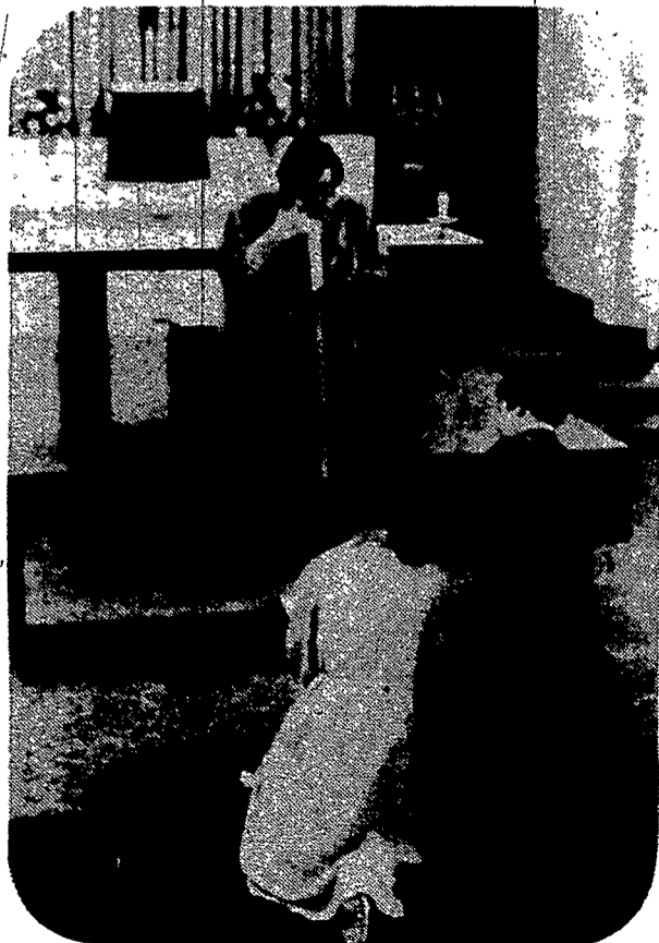
HEROD: My apes prance for nothing my cockatoos speak for a piece of fruit. Can you pull out of your sleeve just a little pigeon? This man has no skill. I could save you, would hire you for my feasts if only you would repeat just one of your tricks.