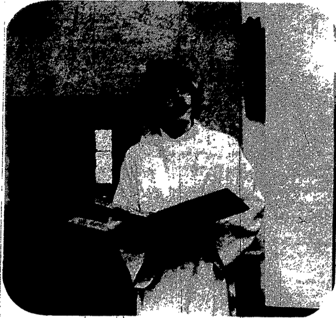
PETER: It is cold here. Fear grows an evil tangle in my brain. It is not a night I wish to remember.