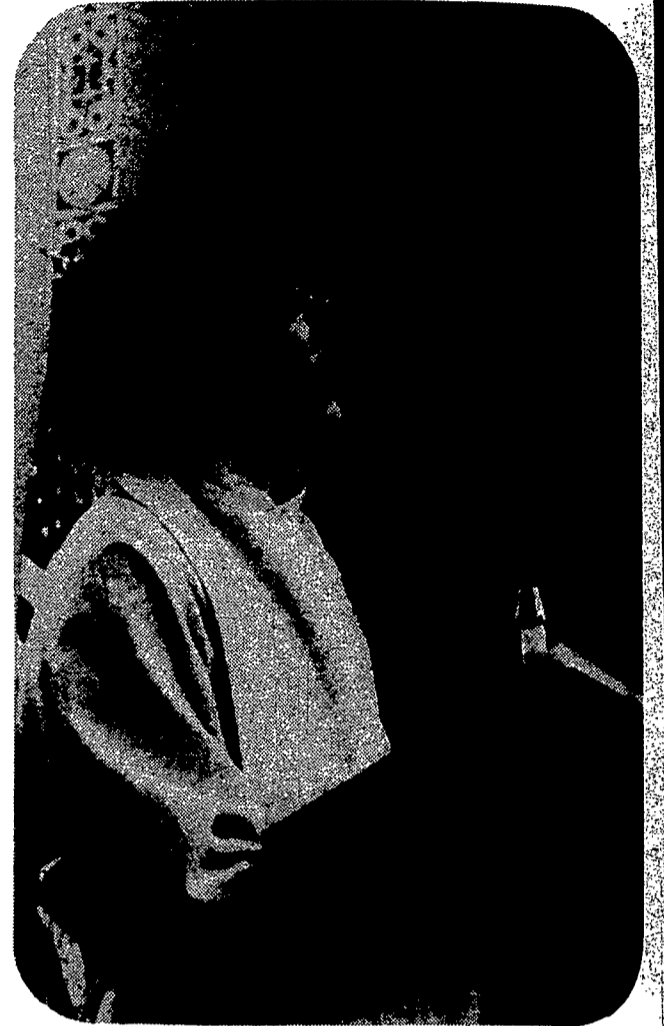
JAMES: A little while ago the Master said: "Ask and you shall receive That your joy may be full." Can we approach this joy only by dark of night with rooted feet and aching mind? How long shall we wait?