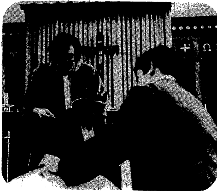
HEROD: Enough of this farce! Dress him up. Choose a robe banded in gold: he is a king, you know! All of you, get out of my sight!