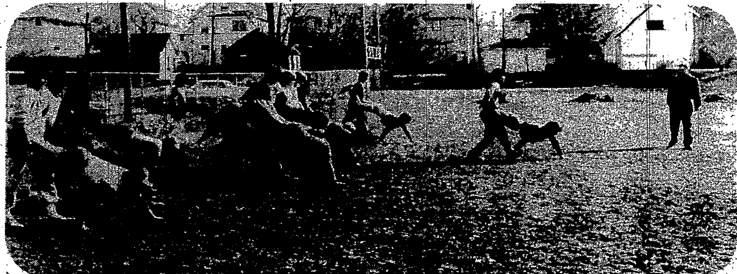
Aspiring athletes at Aquinas Institute have a strange way of working out as they take to the field in preparation for summer sports.