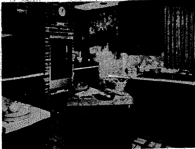
COUNTRY KITCHEN by St. Charles features Mission Styling in briarwood for cabinets and offers warm, hearty atmosphere for the person who likes to cook. All St. Charles wood exteriors are fabricated from large panels for matched grain within individual units and complete finish continuity throughout the assembly. Island cutting board is given special attention with finely finished set of drawers for a variety of storage needs.

where the company's expertise shines. Recessed fluorescent lighting for work areas, illuminated china cabinets, soffit lighting, special fixtures and spots may be considered where appropriate.