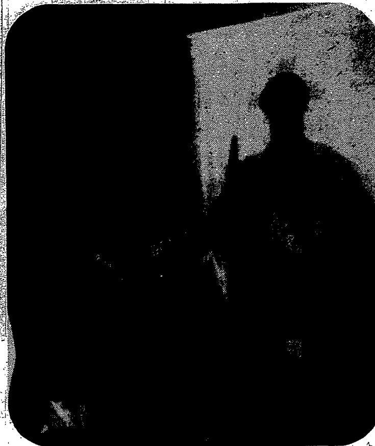
Singers from AMS Zion Church and the Powerhouse Church of God recently took part with the Office of Black Ministries in a revival.

The Office of Black Ministries gave itself a birthday party last Sunday afternoon. In spacious Pastoral Center rooms decorated with African artifacts and paintings and carvings by local artists, the board of directors served tea to 150 visitors.