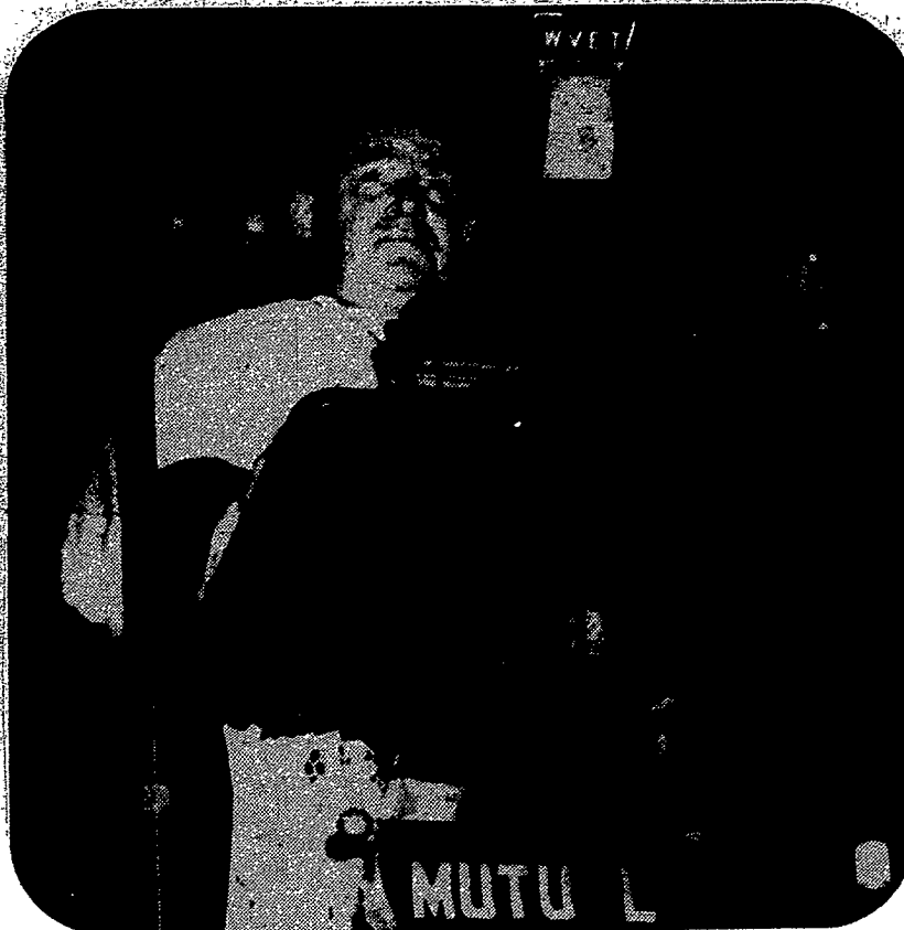
Speaking at the Holy Name rally at Red Wing Stadium in 1949.