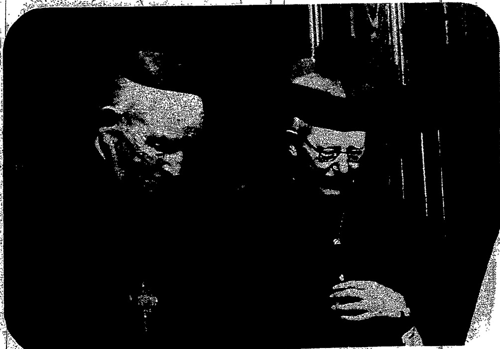
With Bishop Walter Foery of Syracuse.