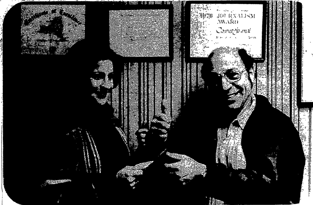
I'm a Winner!