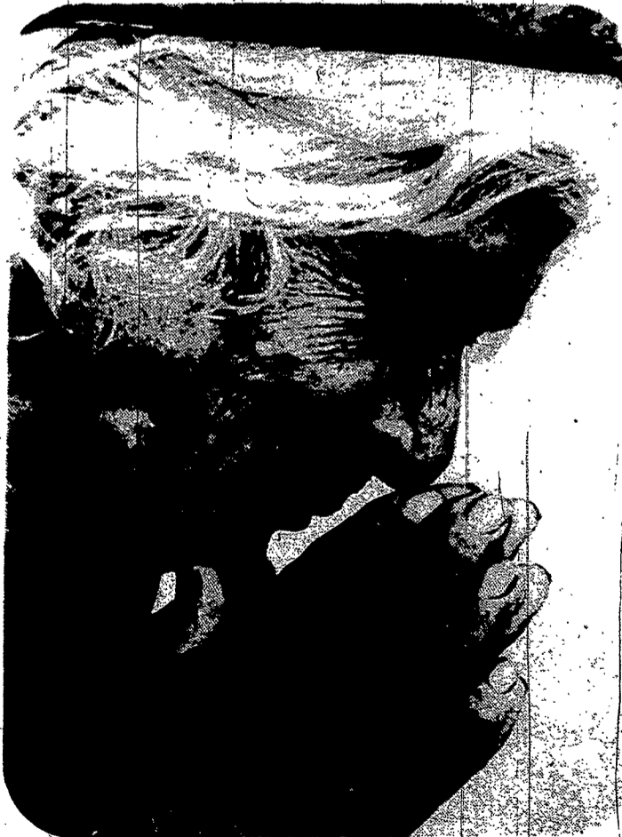
Praying for Peace