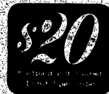
Illustration above is shown enlarged in order to bring out detail. Actual size is same as U.S. quarter.

For faster delivery on BankAmericard or Mastercard orders, phone in your order to our toll-free WATS line (all states except Calif.): 800-423-2606.