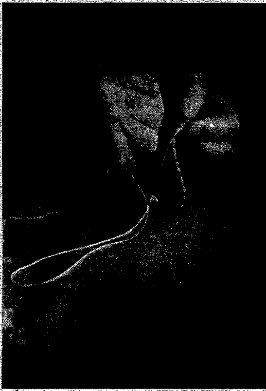
A Prayerful Occupation