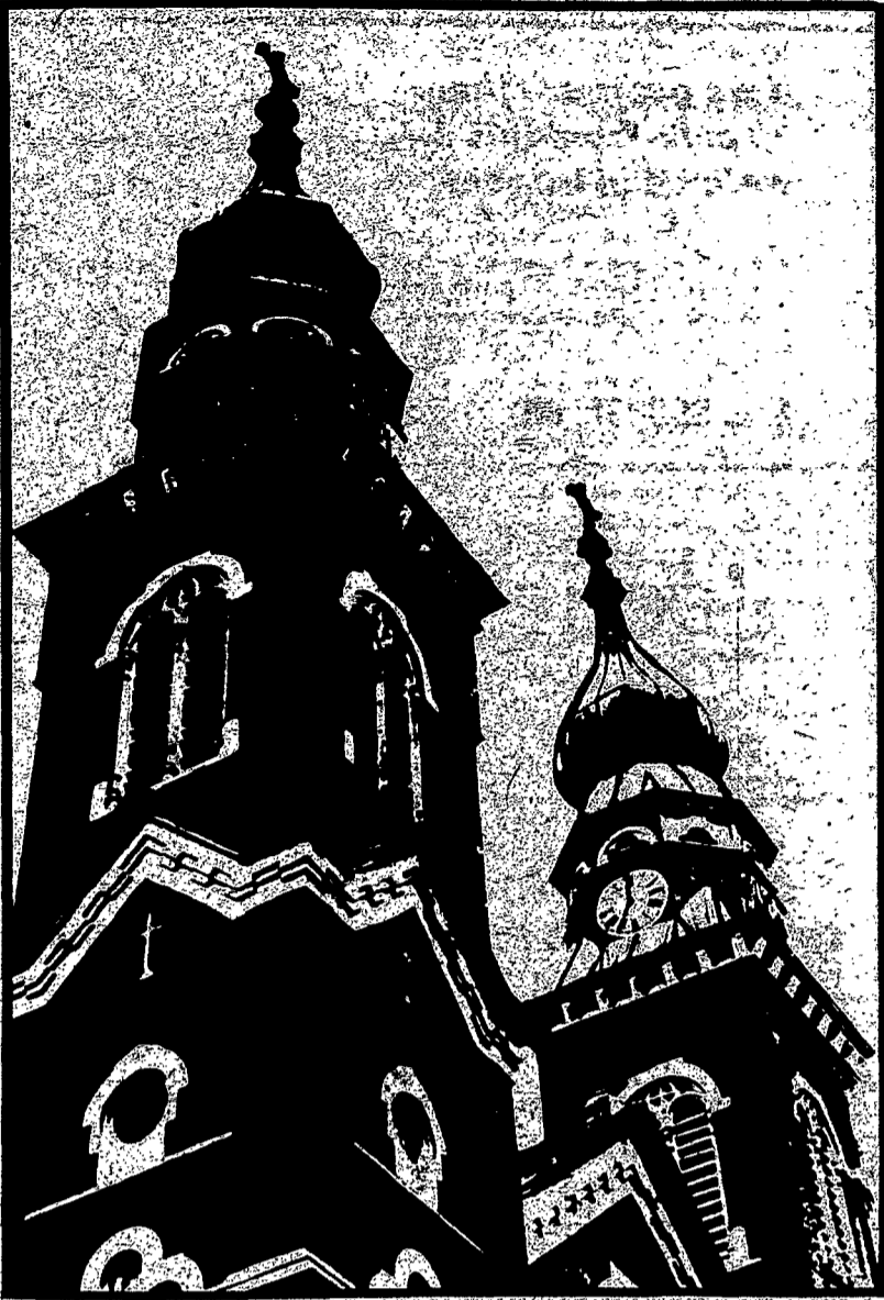
HOLY REDEEMER