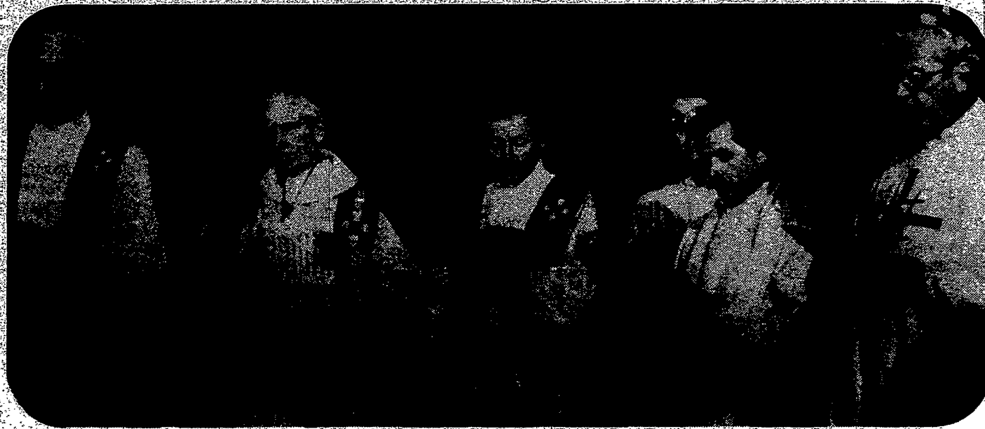
Bishops and priests stand at the altar.