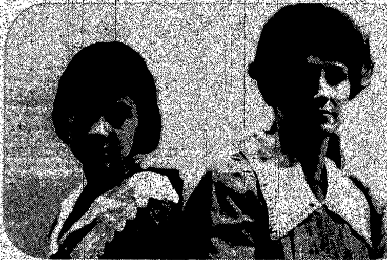
Biography on Stage