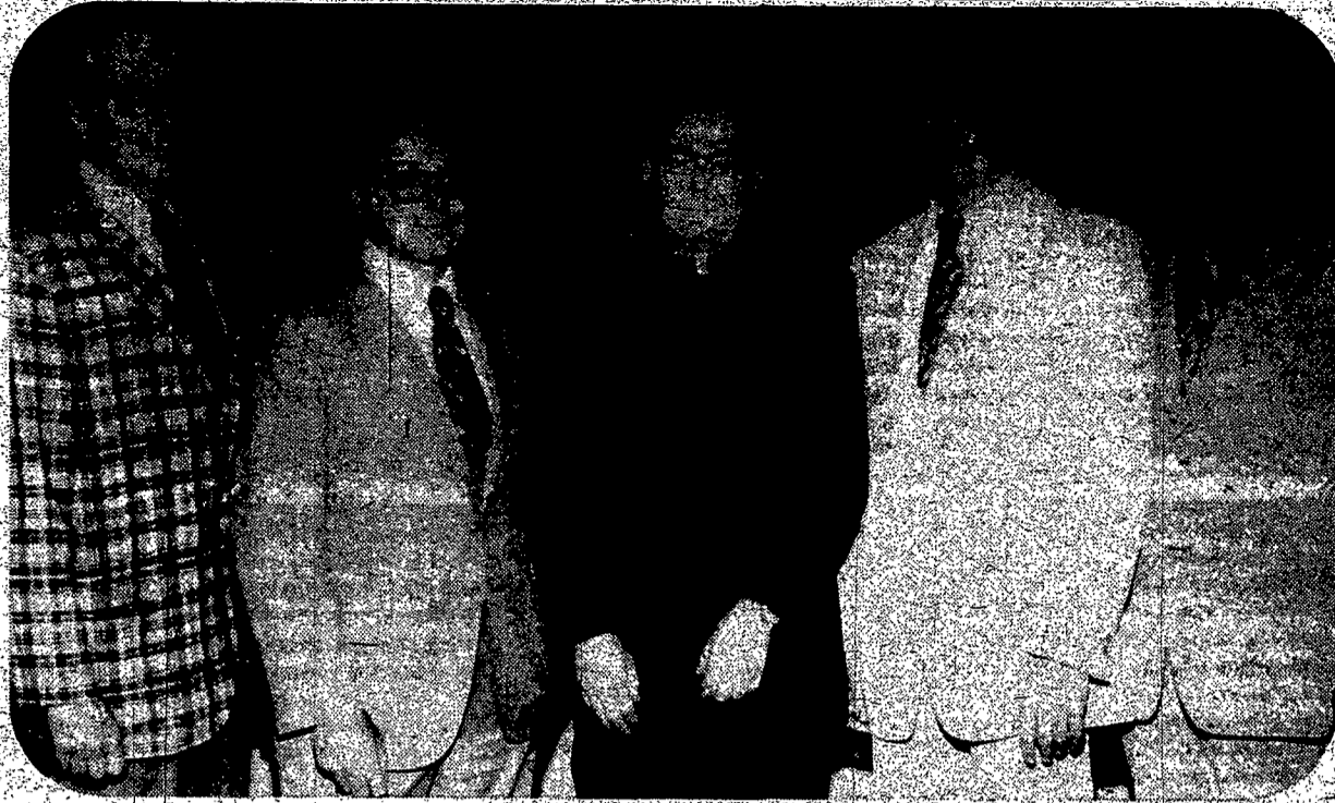
Red Mass Sept. 24