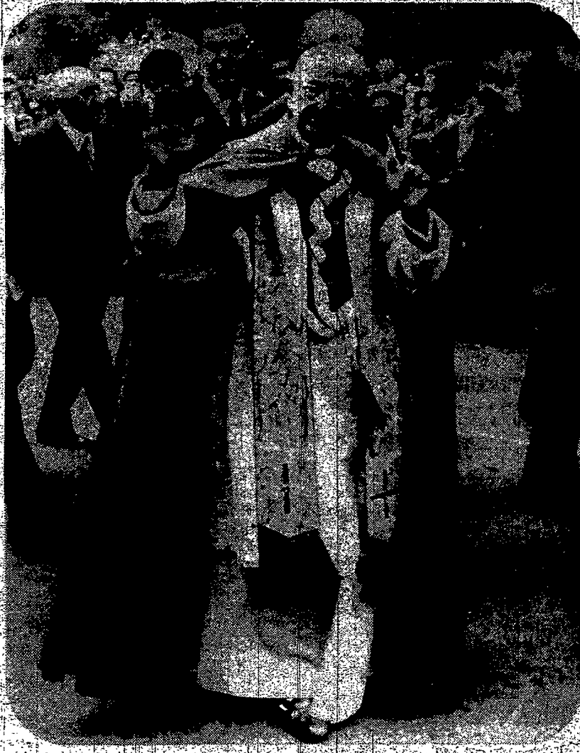
Way to Mass

Pope Paul waves to the crowd as he heads from his summer residence to the church in Castelgandolfo to celebrate Sunday Mass.